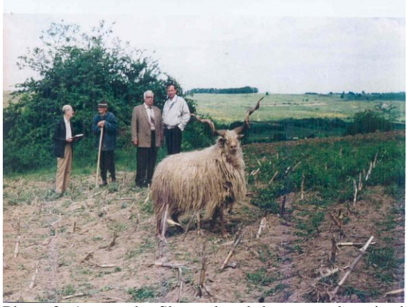
Photo 2. A ram, the Shepard and the researchers in the Romanian Dogneciu area

In Romania, there are not enough scientific research works on the morphological aspects of the breed. It is not yet clear, but it seems that in Corkscrew Valachian sheep the black color is recessive, reverse as Tsurcana breed (Valachian, Zackel). It seems that its conformation and development is not too compared to different the Hungarian Corkscrew sheep, frequently presented in literature (Bodo 1996), although the last one is bettered selected and more uniform in development and conformation. There are also differences regarding the position of the horns (just uniform straight V twisted horns in the Hungarian sheep, the Romanian one has also lateral straight horns) and the Hungarian is more uniformly coloured (white wool, reddish face and legs, or black wool, face and