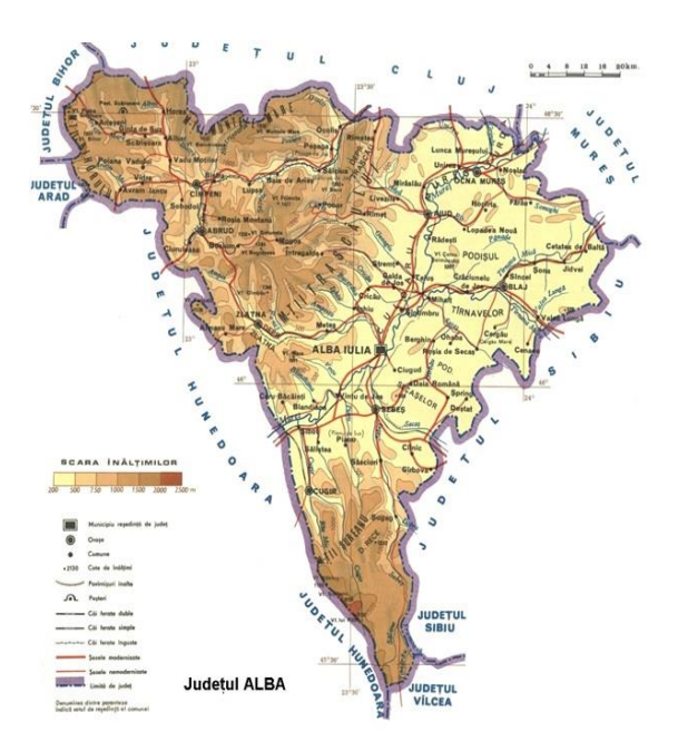
Fig. 1 The map of the Alba county

The Alba County is situated in the central part of Romania, occupying a surface of 624,200 ha. being dominated by the mountainous area, the town Sebes is situated in the area of influence of the mountain and at the limit of separation of The Secaselor Plateau with the river Mures passage. Due to its geographic position the town Sebes is characterized by a medium continental climate having an average yearly temperature of 9.3C.