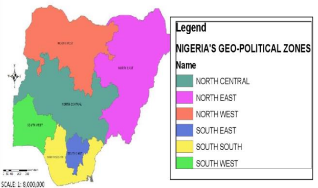
Fig. 2. Map of Nigeria showing north (northwest, northeast, and north-central) and south (east, southwest, and south-south).

with minerals and vitamins. In line with many efforts to reduce the menace of micronutrient deficiency, the Nigerian government, in collaboration with a broad spectrum of stakeholders, has been subsidizing the supply of bio-fortified rice seeds. This intervention is expected to increase productivity and reduce nutrient deficiency among women and children. According to [10], Nigeria has seen remarkable progress in rice production in the past ten years, with growth rates of 1.3% and 2.3% for 2018 and 2019, respectively.