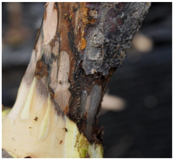
Photo 8. Necrosed wood of the apple tree stem.

At steremycroscope were analysed the branches, sprigs and stems. There were observed the open lesions, the cracks from the bark and the swellings.