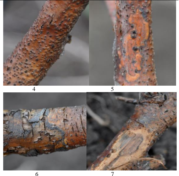
Photo 4 - 7. Reddish – orange bark, rugous, cracked, xylem necrosis.