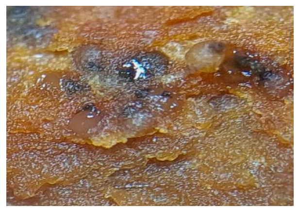
Photo 14. Young pycnidia.