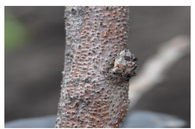
Photo 3. Bark with rugous appearance