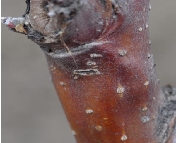
Photo 2. Swollen bark, reddish and with young fructifications specific to the fungus Phomopsis mali .

areas with swollen bark, under the bark were found dozens of fruiting bodies of the fungus; old ulcerations, rugous, verrucous, black (at their surface were placed the black coloured fruiting bodies of the fungus); blacken xylem tissue in section; cracks in the bark tissue from the branches (in the cracks were small black bodies, respectively the fungal pycnidia); great parts of ligneous tissue browned in trunks and branches joints; the sprigs with healthy appearance were having browned areas under the bark that was surrounding the buds; the cortical tissue of the roots was rotten and was brown in colour in transversal section; radicular system with obvious diseased signs (browning); browning of the central cylinder of the lateral root system (Photo 2-8).