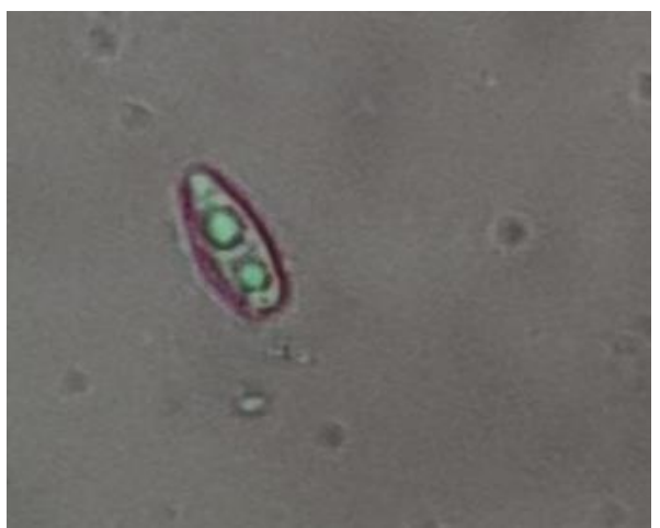
Photo 17. Alpha conidia at the microscope (x40). Source: Original photo by Cotuna O. (2021).

Source: Original photo by Cotuna O. (2021).