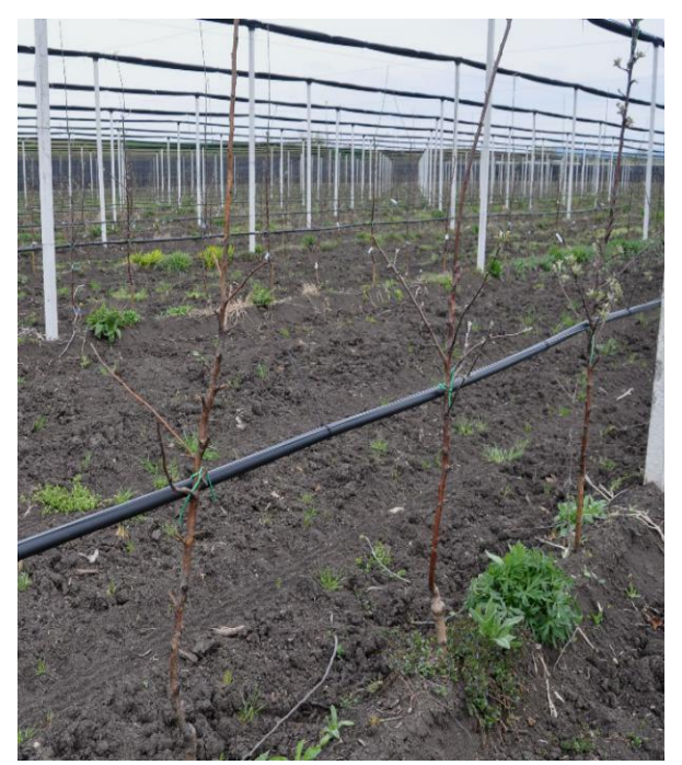
Photo 1. Aspect from the apple orchard during the sample collection (in Arad County, Romania).

The biological material was sampled directly from an apple orchard from Arad County in April 2021 (Photo 1). The apple orchard is cultivated in super-intensive ecologic system (2000 trees/hectare) and it was planted during the years 2019-2020. There were collected samples from plants consisting in branches, trunks, sprigs and roots (entire plants) from every variety cultivated in the orchard, respectively Primiera, Crimson Crisp, Gold Orange and GoldRush. The samples were brought in the laboratory where first were stereomicroscope. analysed at The photographs were taken with a Nikon camera with micro-objective. The frequency of the dry trees due to the disease was set by their counting ant reporting to the total number of the analysed trees. In the same time there were analysed and photographed the external symptoms at every 20 trees from every variety.