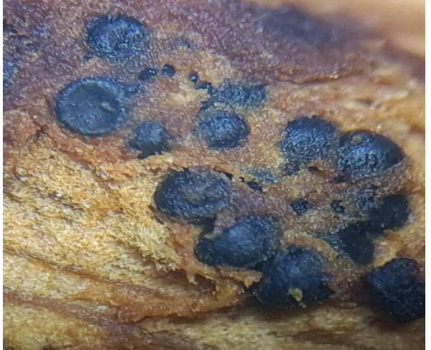
Photo 9. Agglomeration of pycnidia under bark