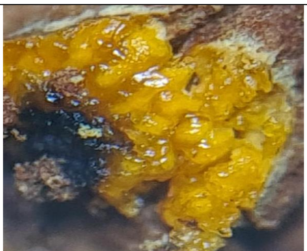
Photo 15. Pycnidia in formation.