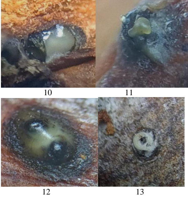
Photo 10 - 13. In the presence of humidity from the pycnidia were expulsed white-cream mucilaginous masses. In contact with the air takes different shapes