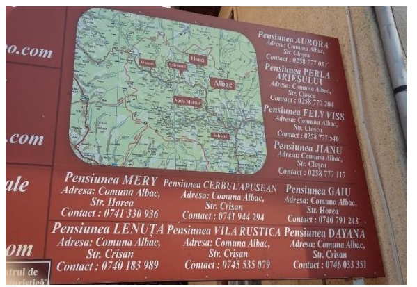
Photo 1. Advertising panel with the accommodation units from Albac commune, Alba county

For a good presentation of the tourist services, the owners of agritourism pensions from the Apuseni Mountains area [13] tried by several means to make their presence known in the tourist field (Table 1). Thus, a number of 51 respondents made web pages on the Internet, 46 respondents made brochures, leaflets, business cards, they installed billboards with the pension in visible places, on the road (Photos below).