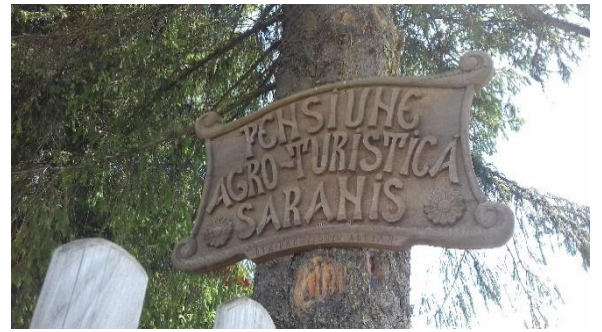
Photo 3. Advertising panel Saranis Agritourism Pension, Beliş commune, Cluj county

84 respondents stated that they used booking and promotion sites for both domestic and international tourism market. especially Hungarian, among which we can mention: www.portalturism.com, www.LaPensiuni.ro, www.Travelminit.ro, www.Carta.ro. www.TurismInfo.ro, www.HotelGuru.hu,, www.CautPensiuni.ro, www.Booking.com, www.DirectBooking.com, www.TripAdvisor, www.Travlocals.com, or they advertised on facebook.