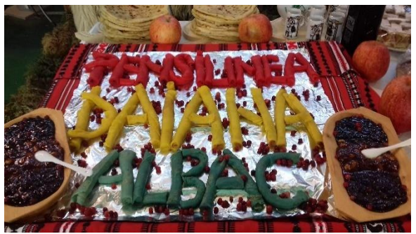
Photo 4. Promotion of Daiana Pension at the National Rural Tourism Fair 2018 in Albac, Alba County

A number of 21 respondents participated in local, regional or national activities or fairs: ex Albac National Rural Tourism Fair (i.e. Daiana Pension, Albac commune, Alba county), (Photo 4) at the Fair Bucharest International Tourism Board (eg Pension from Vaţa to Brad in Vaţa de Jos commune, Hunedoara county or Casa Pera Pension in Basarabasa village, Vaţa de Jos commune, Hunedoara county).