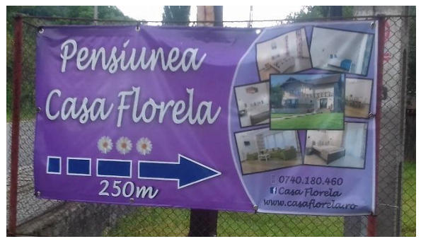
Photo 2. Advertising panel Casa Florelaagritourism pension, Căpușu Mic village, Cluj county