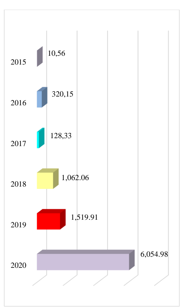
Fig. 1. Total area that received payments (ha)

If we take into account the information presented above (Tables 1, 2 and 3), we find a total county area, which benefited from support through Measure 11 according to Figure 1.