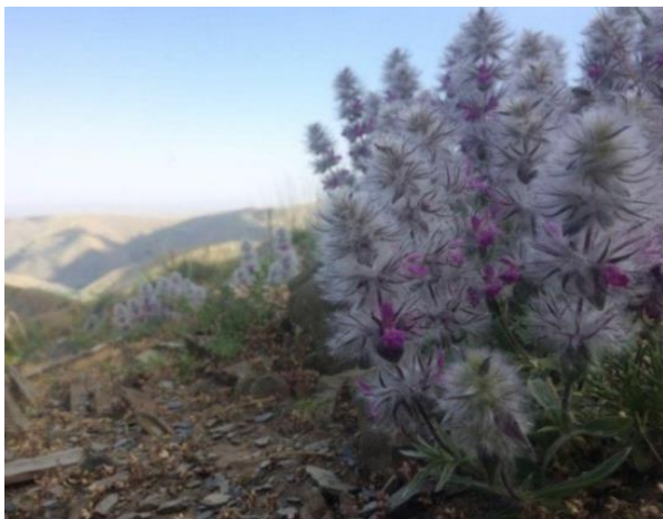
Photo 2. Medicinal plants in the research area

In this study, multi-stage sampling with proportional assignment was used. Cochran's formula was also used to determine the sample size (Equation 1). The statistical population of the study was the producers of medicinal plants in Torqabeh village located in Binalod Township in Iran. Due to its favorable climate, this area is a great advantage for the growth and cultivation of