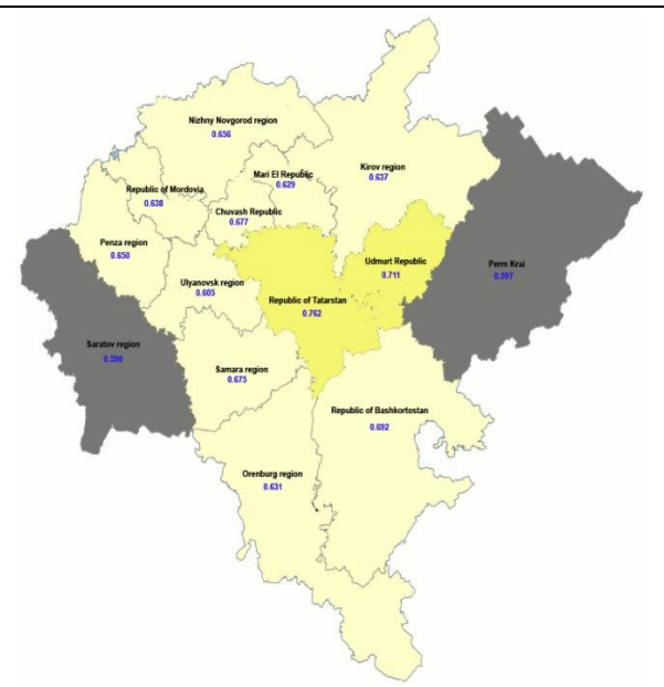
Fig. 2. Distribution of rural settlements of the PFD by region by level of socio-economic and demographic development

The Perm Region and the Saratov Region are distinguished by high rates of unemployment and population migration and are centers of socio-economic and demographic disadvantage in the PFD (Fig. 2).