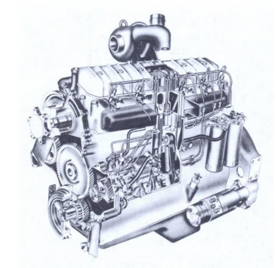
Fig. 2. Six-cylinder diesel tractor engine Source: [8].

economic performance of agricultural aggregates is appreciated by the following techniques, also called indices of use or exploitation [3].