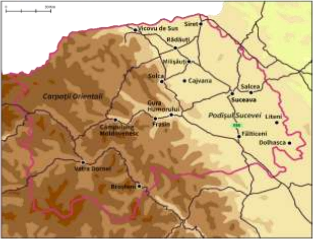
Map 2. Suceava County