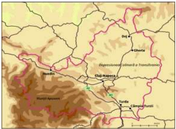
Map 1. Cluj County