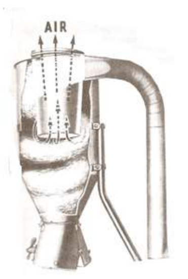
Fig. 3. Cyclone separator Source: [6].