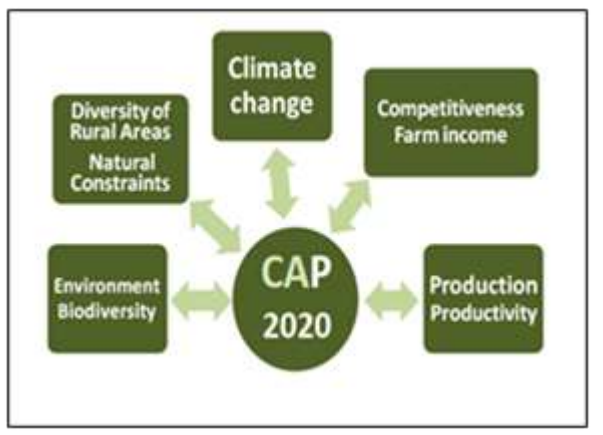
Fig.3. Main objectives to be met by the revision of the Common Agricultural Policy (CAP) [4].

and wide crop rotation, enables realization of agricultural sustainability and sustainable crop production intensification.