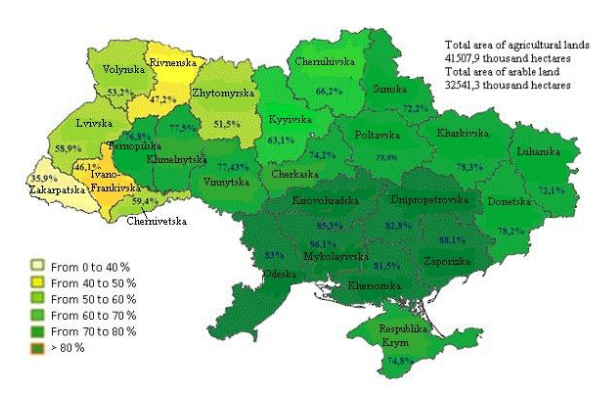
Fig. 3. Employment of agricultural lands in the regions of Ukraine

Excessive employment of lands (above 54% of the land fund of Ukraine), including the land on slopes, has caused deterioration of ecologically balanced correlation of agricultural lands, forest and water objects. It has made a negative impact on stability of agro-landscapes and caused a considerable anthropological load on ecological sphere.