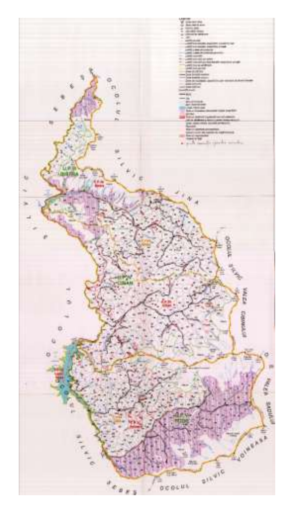
Fig.1. Region Map (orig.)

downstream located, on the line of highest slope and going on clockwise in the three plantations of the Miercurea Sibiului Forest [24] Range and the traps 82 to 85 in the Tilişca Forest Range.