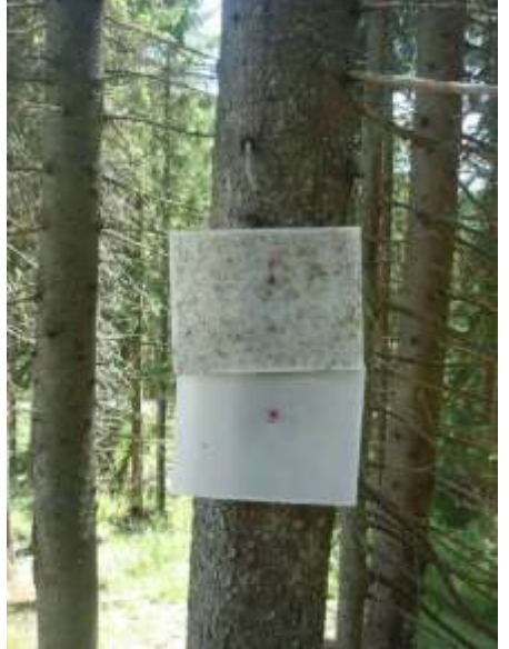
Fig. 2. Pheromone traps installed in stand (orig.)

conditions both on the pheromone attraction and on the level of the insect populations.