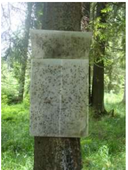
Fig. 3. Atralymon pheromone traps (orig.)

Regarding the average captures made on in different repetitions, it was ascertained that there are differences between them, this fact proving the influence of the stationary