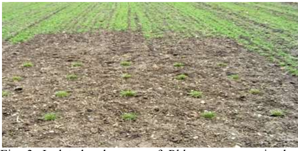
Fig. 3. Isolated poly-cross of Phleum pratense in the field testing.

bred. Also, protein and cellulose contents were important in this regard. Major limitations are due especially to climatic conditions, the harvesting momentum and the skills of the involved team. Field testing was also complex and therefore only considering the dry mass as well as the fresh weight mass production proved to be the subject of a height variability interspecific as well as intraspecific.