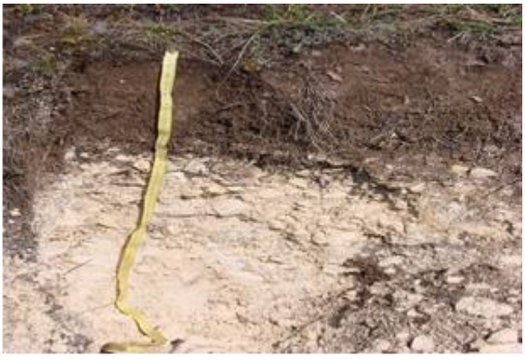
Fig. 4. Rendzinas developed from marly opoka, Western Podolia region