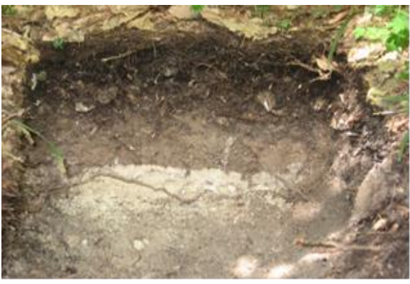
Fig. 5. Rendzinas developed from Upper Baden limestone of Rostochchya region