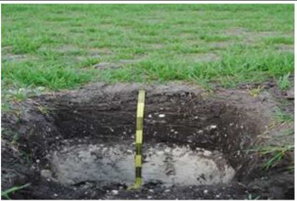
Fig. 3. Rendzinas developed from cretaceous marl, Malyi Polisya region