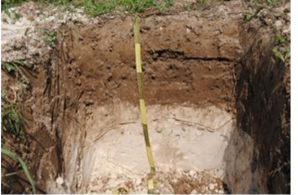
Fig. 2. Rendzinas developed from chalk, Volynian Polisya region

– a sufficient part of humus containing profile falls on humus-accumulative (mollic) horizon H \kappa (Ahpca): agroheterogenic, residuallycarbonaceous (MO-2-10%, CaCO<sub>3</sub>), content of organic matter - 2-5%, the capacity is about 35 cm, dark-grey with brown colouring (10YR6/1). Texture dribnozem – SL. It has been stated that 80-90% of cretaceous marl detritus are of effective diameter (d) from 20 to 7 mm; 20-10% falls on detritus with d < 7 mm.