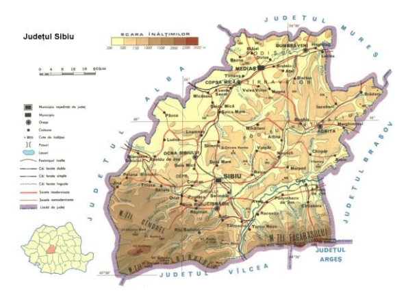
Fig. 1. The localization of Avrig locality in Sibiu County

regions. Sibiu County is no exception. Beekeeping has become an increasing concern especially in villages.