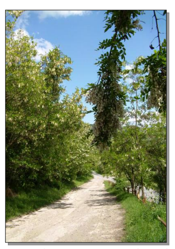
Fig. 2. Robinia pseudoacacia L. - acacia (original)

The diversity of the landscape caused a great diversity of flora (Fig.2, Fig.3).