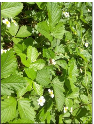
Fig. 3. Fragaria vesca L. Fraga-bee-pollinated (original)

Avrig area includes over 402 species of cormophytes [4]. Of these, in the period of the study, there were 45 plant species identified as suitable for honey production (Table 1).