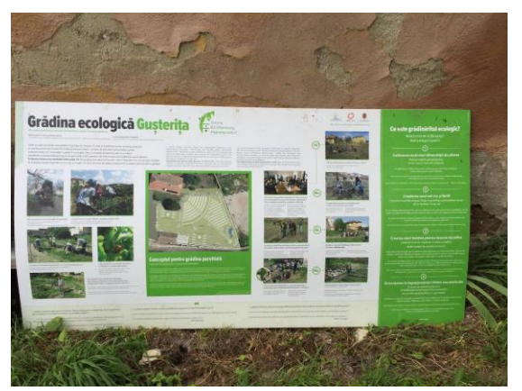
Photo 1. Environmental Education Center Evangelical Church Gușterița- Sibiu (orig.)

This study was conducted on the surface of 4,800 \text{ m}^2 vegetable garden inside the Evangelical Church in Gusterița neighborhood in the city of Sibiu. GPS location coordinates are 45 ° 44 '13.74' north latitude and 24 ° 06 '22.26' 'East longitude. (Photo 1).