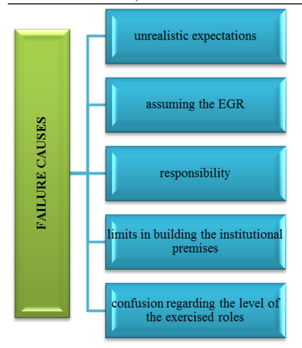
Fig. 4. Causes of the failure in implementing EGR 109

-Unrealistic expectations: the Rule has been promoted by mass-media as offering a steady and quick remedy for solving problems in the public sector. The expectations were high, therefore the disappointment was inevitable. Obviously, it is wrong to assume that the simple change of the managing boards and managers will help the problems accumulated all along a number of years disappear. Instead of presenting OUG 109/2011 as a quick solution for solving problems, authorities should have described it as part of a more and long-term complex process strengthening public administration.