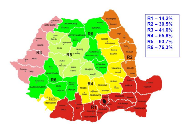
Fig. 3. Map coverage on ecological macro-regions of Romania

snow and wind strength, requires the achievement of the protective forest curtains in the Romanian Plain (Bărăgan), in southern Moldova and to a lesser extent in the Western Plain. (Fig. 3) [4]