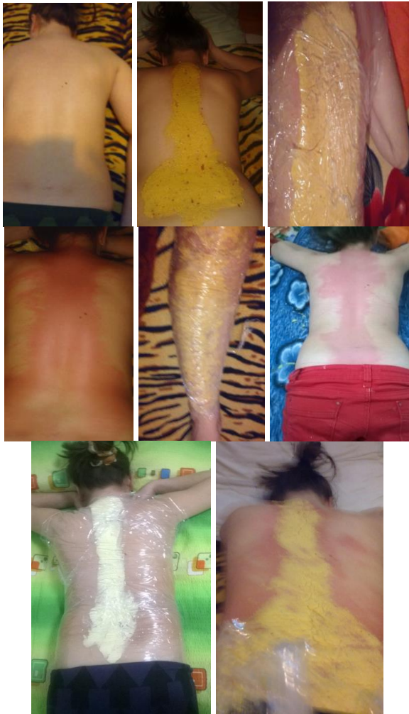
Fig. 2. Results obtained after the appliance of the natural cream against the cold